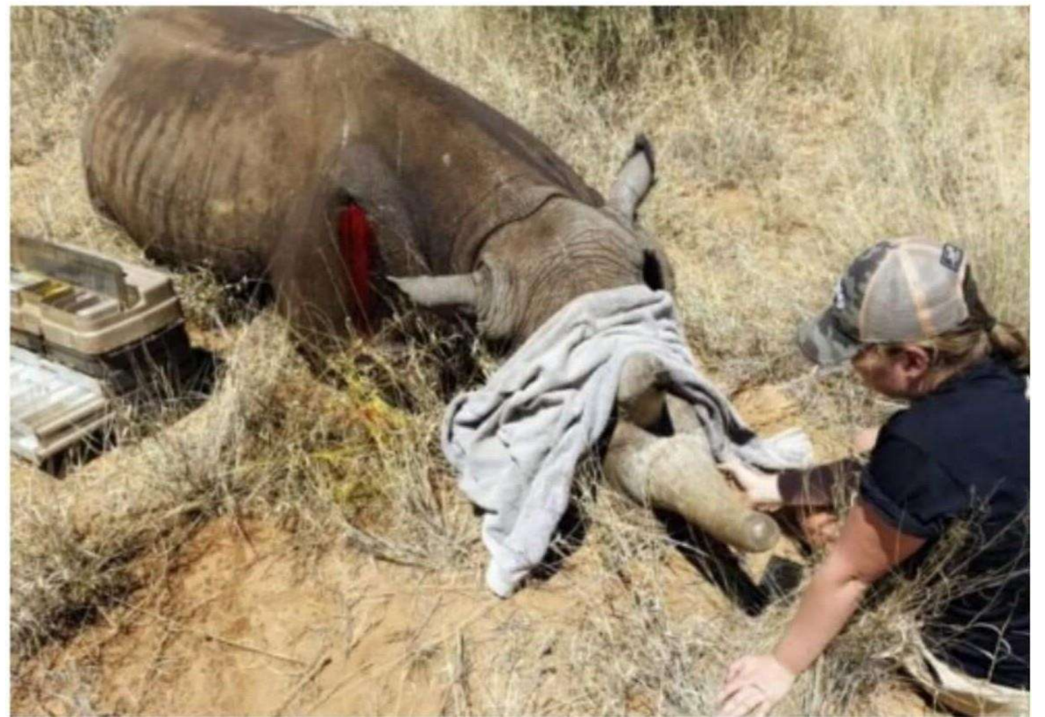
Veterinary Work on Rhino