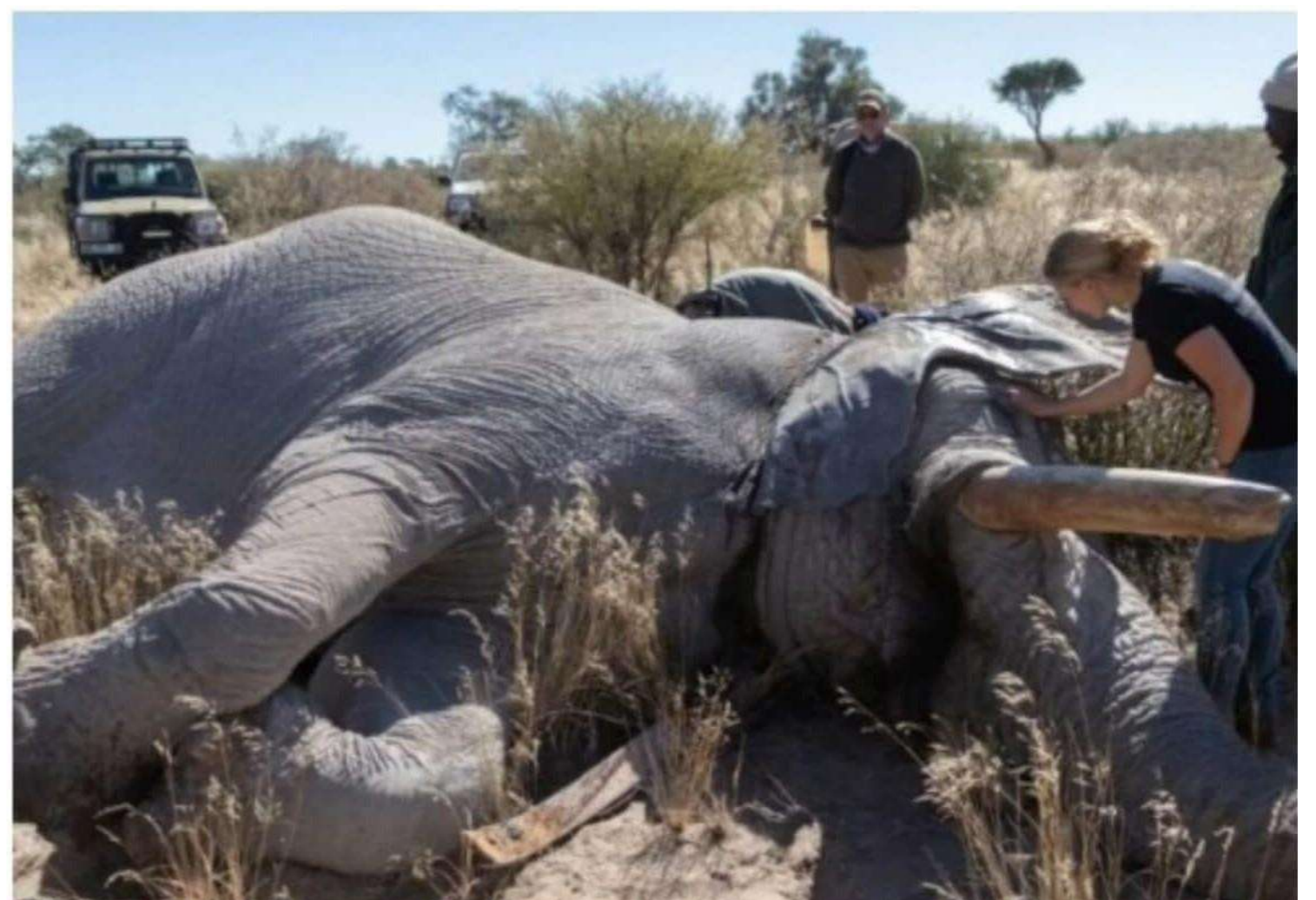
Removing an Elephant's Collar