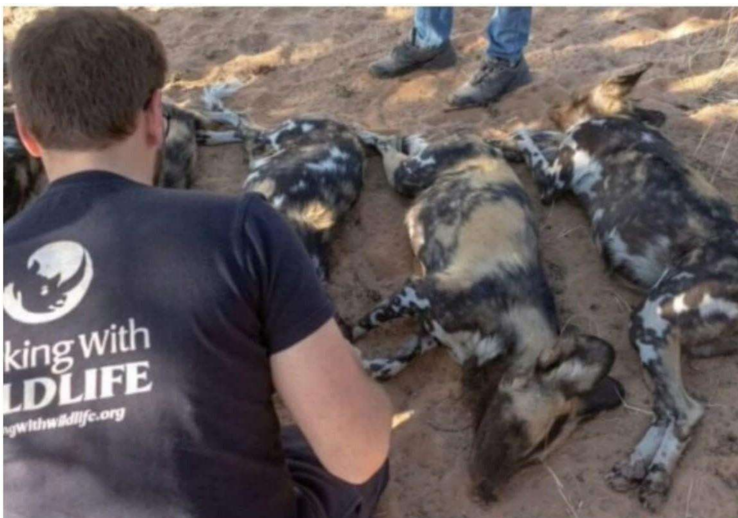
Relocating African Wild Dogs